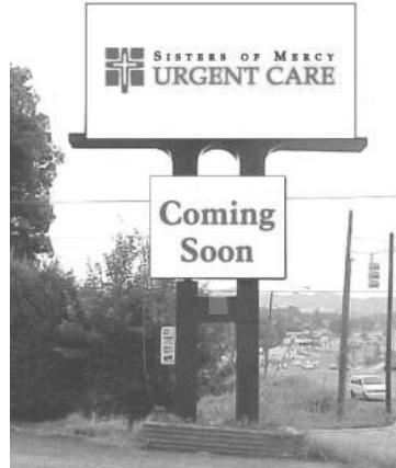
Site of new Urgent Care West facility that will also provide office space for Sisters of Mercy Services Corporation administration and business office

The 15,000 square foot center will also house the administrative and business offices for our organization. It's now estimated that the building will be ready for occupancy in Spring 2008.